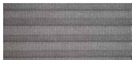
591-06 STONE GREY