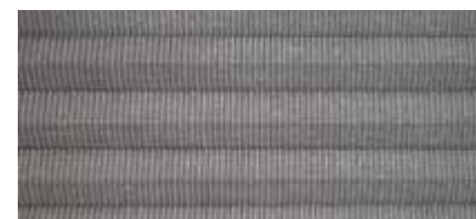
590-06 STONE GREY