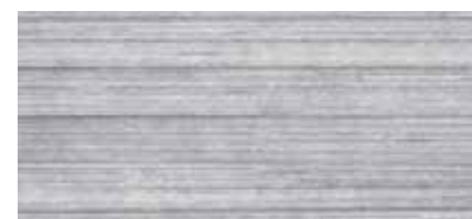
5248 LIMESTONE 25