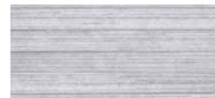
5243 - 0400 MIST 25 45