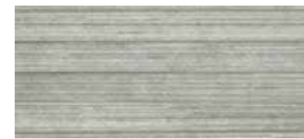
5245 - 0600 MOSS 25