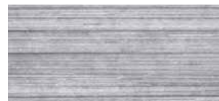
5242 - 0300 CHARCOAL 25 45