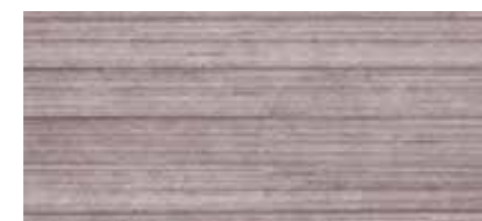
5241 - 0200 COFFEE 25