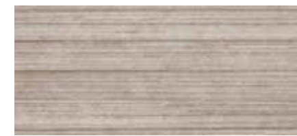
5247 CINDER 25 45