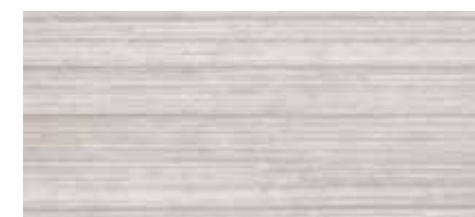
5240 - 0100 SAND 25 45