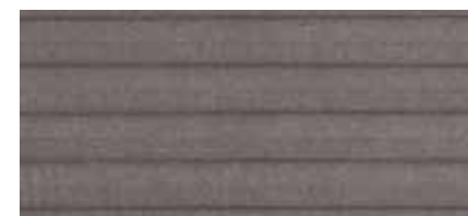
760-11 CINDER 20 25 32