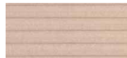
760-05 APRICOT 25 32