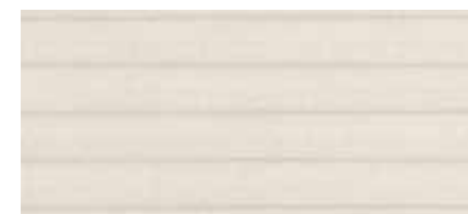
760-03 MELON 20 25 32