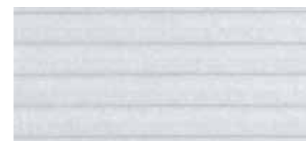
760-01 SNOW 20 25 32