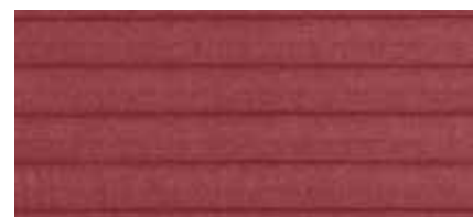
760-22 RASPBERRY 25