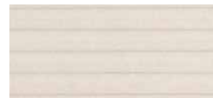
760-02 BRIGHT 25