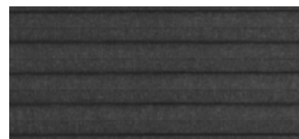
760-09 STORM 25 32