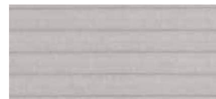
760-06 DOVE 20 25 32