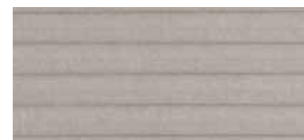
760-07 GREIGE 25 32