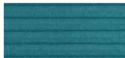
760-14 TEAL 25