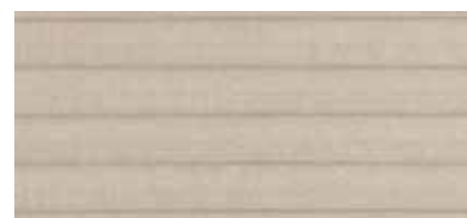
760-04 SAND 25 32