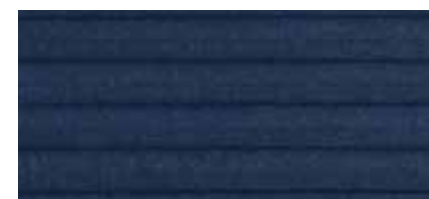
760-13 INDIGO 25