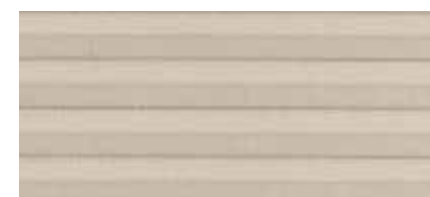
560-04 GREIGE 25 32