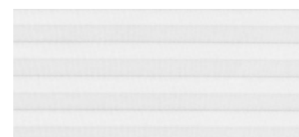
560-01 WHITE 25 32