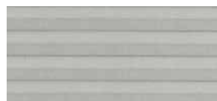
560-10 MIST 25 32