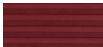
560-06 SIENNA 25 32