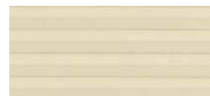
560-02 BRIGHT 25 32