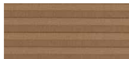
560-05 NOUGAT 25