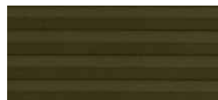
560-07 MOSS 25