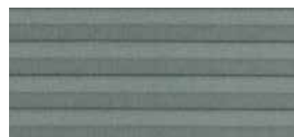
560-11 GREY 25 32