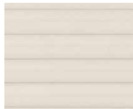
5673E - 5673 CREAM