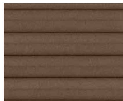
5653E - 5653 BROWN