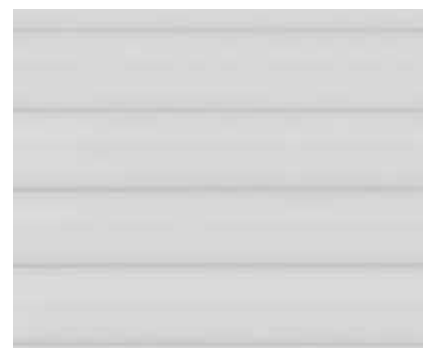
5679E - 5679 OYSTER