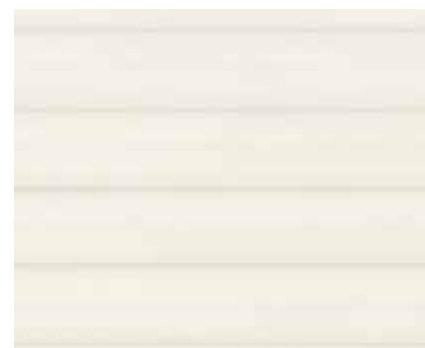
5663E - 5663 BEIGE