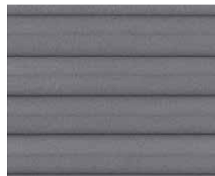
5660E - 5660 DARK GREY