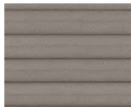
5665E - 5665 LIGHT GREY