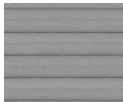
5659E - 5659 GREY