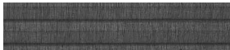
563-06E - 563-06 IRON