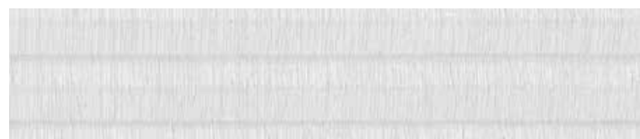
563-01E - 563-01 WHITE