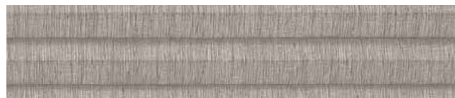
563-04E - 563-04 MOCCA