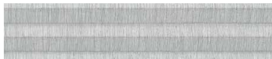
563-05E - 563-05 ASH