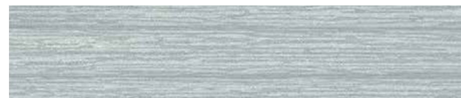
7451 - 0200 MOUSE 25