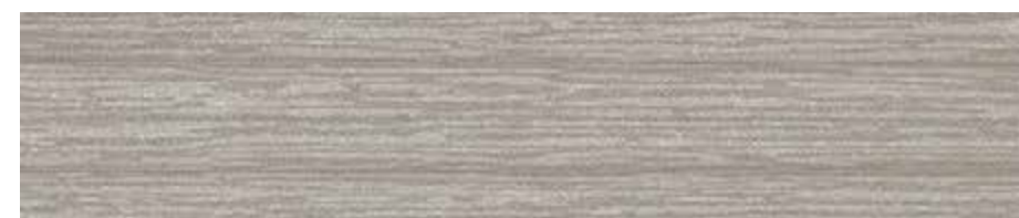
7456 HUMUS 25