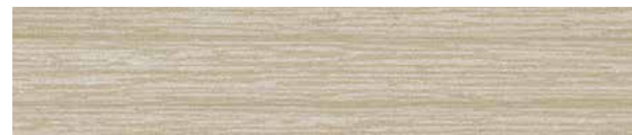
7450 - 0100 SAND 25